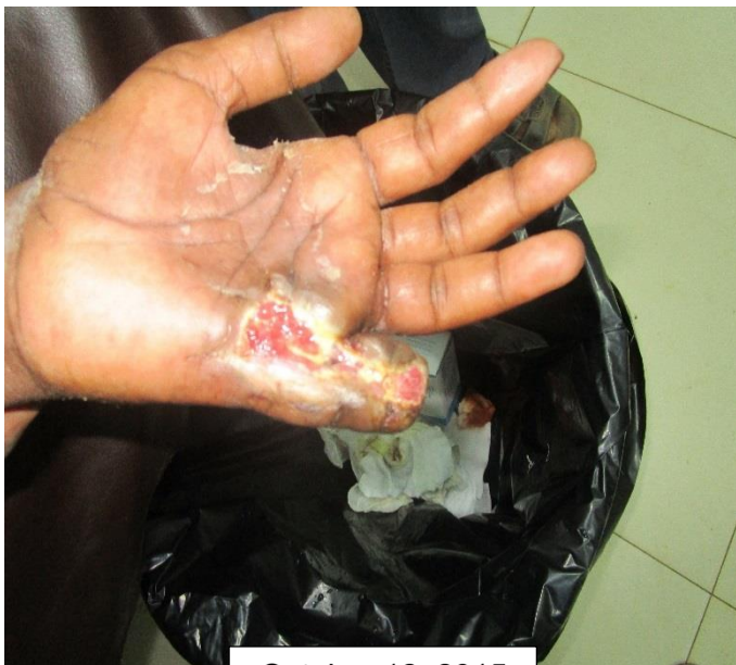
October 12, 2015