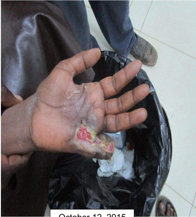
October 12, 2015