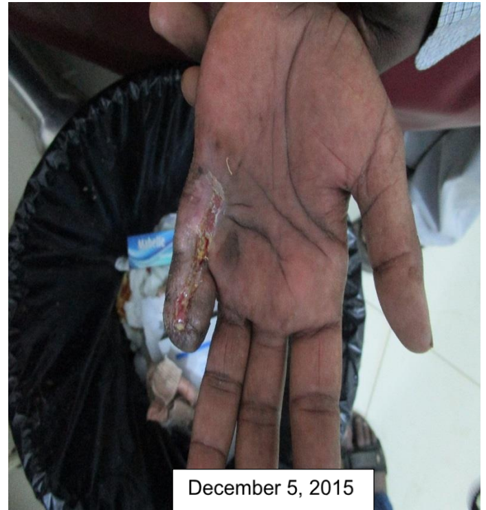
December 5, 2015