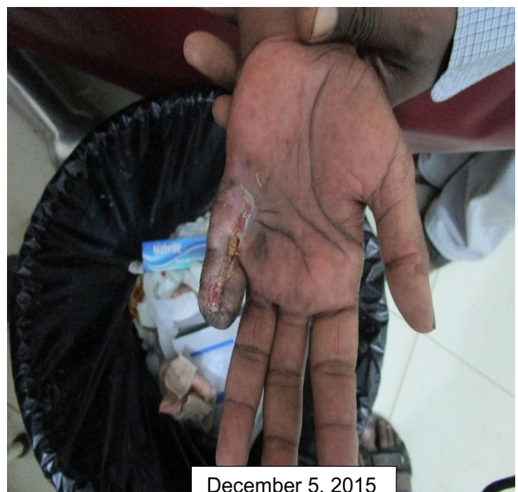
December 5, 2015